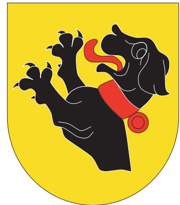
Coat of arms of the Hunziker from Moosleerau